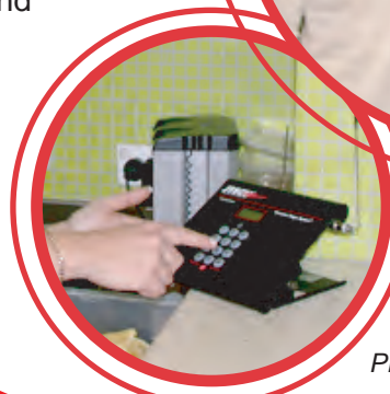
Robust Transmitter with user friendly functions